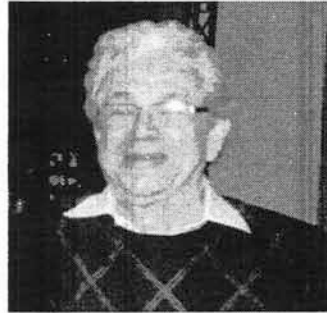
November Guest speaker

General meeting last Monday in January, March, May, September, November