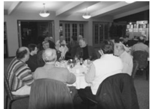
Attendees at January Dinner.