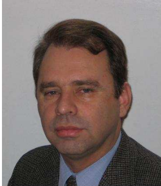
An Open Letter from our District Vice President