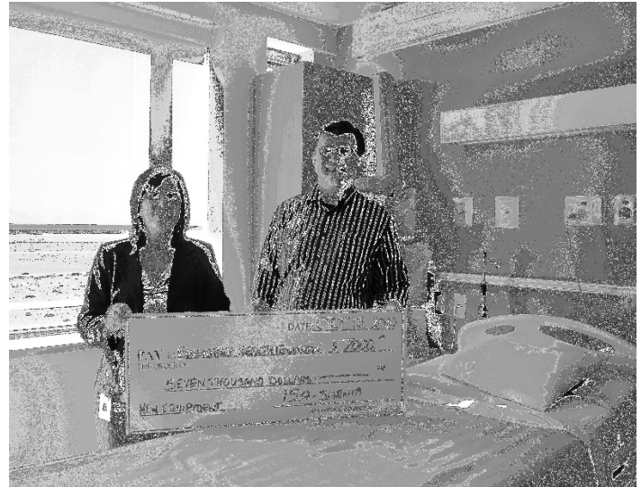
Our President making the donation to the Bluewater Health Hospital in October ($7000.00)

General meeting last Monday in September, November, January, March and May