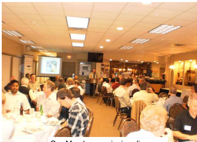
Our Members enjoying dinner