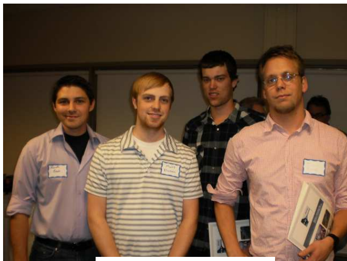
Lambton College Students