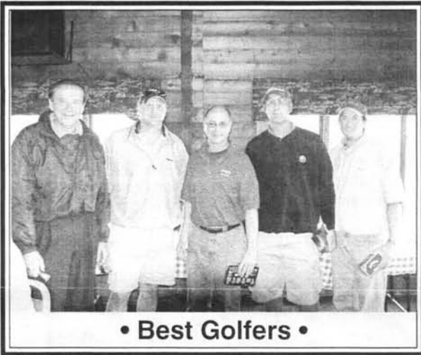
• Best Golfers •