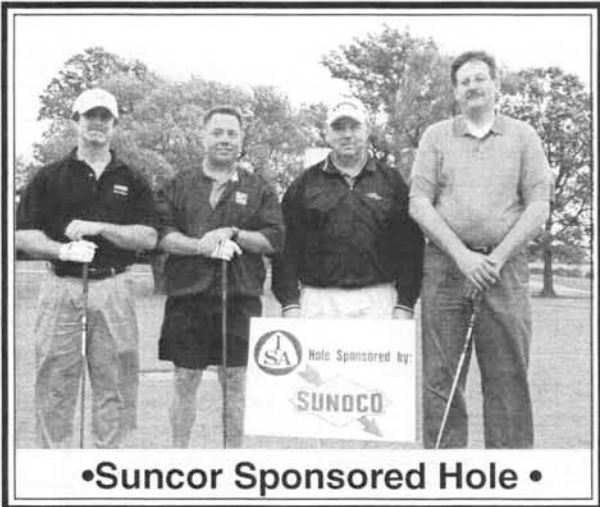
• Suncor Sponsored Hole •