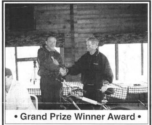
• Grand Prize Winner Award •