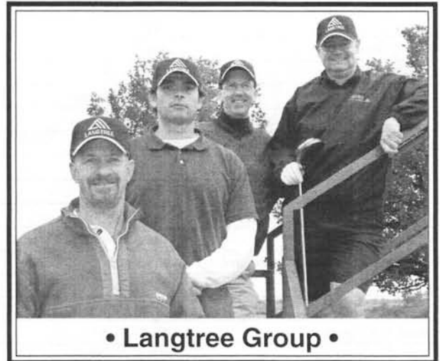
• Langtree Group •