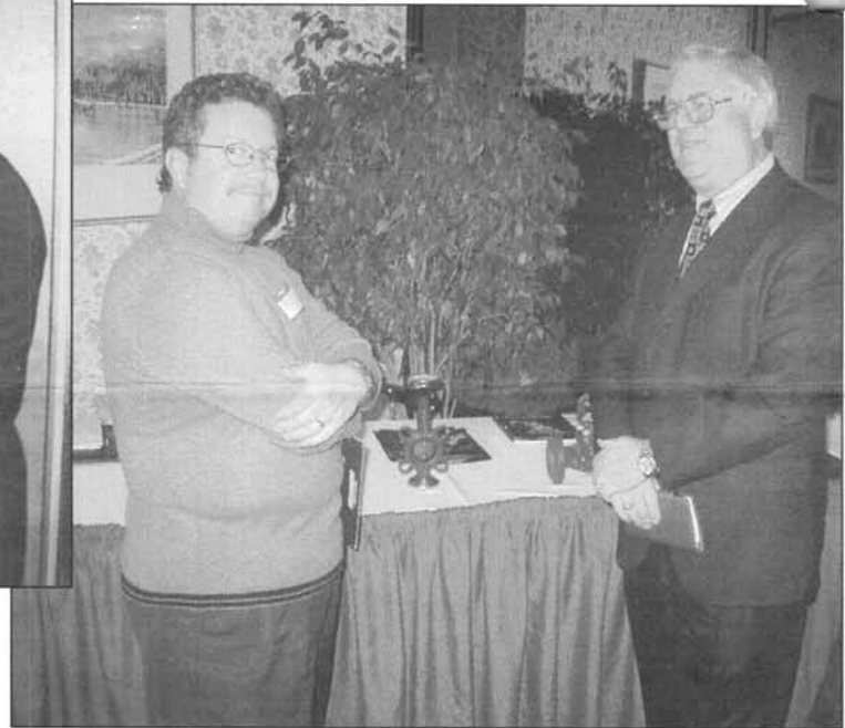
Below: ARI Valve Corp Booth on Display.