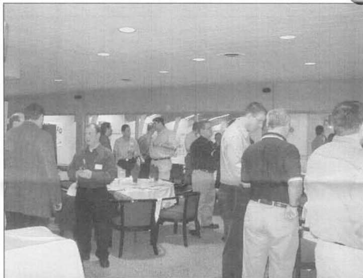
March Dinner Meeting