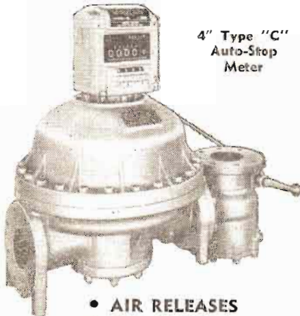
4" Type "C" Auto-Stop Meter